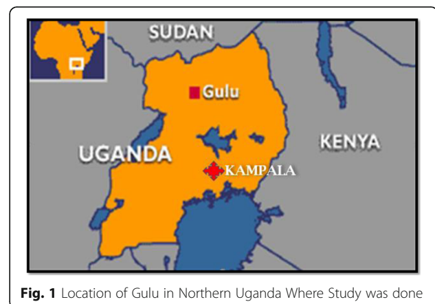
Fig. 1 Location of Gulu in Northern Uganda Where Study was done

A total of 888 children attended the cardiac clinic during the study period (see Fig. 2). Of these, 33.2% [ n = 295 ] had CHD, whereas 36.6% were normal [ n = 325 ] and 30.2% [ n = 268 ] had acquired heart disease [Rheumatic